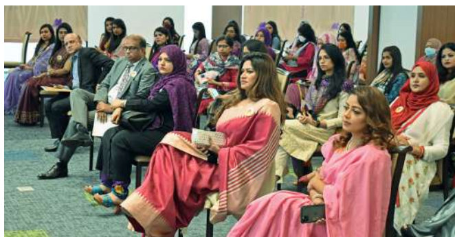
EBL celebrates womanhood at Head Office on 8th March, 2021

Every year we celebrate International Women's Day to celebrate womanhood while calling for greater equality.