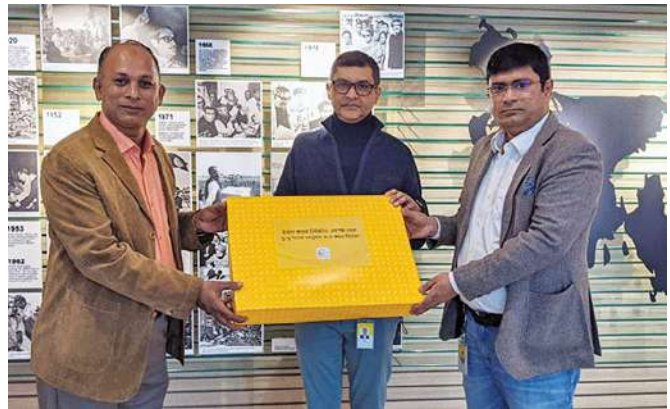
Blankets handover to HEDS for the cold hit people of Patuakhali District

For providing comfort to the disadvantaged people of the street, EBL donated blankets to Uttaran Foundation, to the school students of Faridpur and to the madrasa students of Sirajganj and other cold affected regions of the country. Additionally, we donated blankets to the Health and Economic Development Society (HEDS) for Patuakhali District.