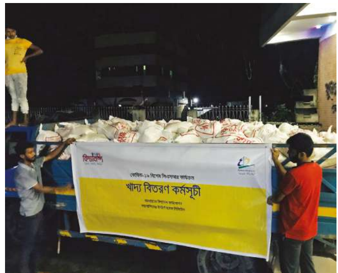
Food assistance for COVID-19 affected people of Khulna division through Bidyanondo