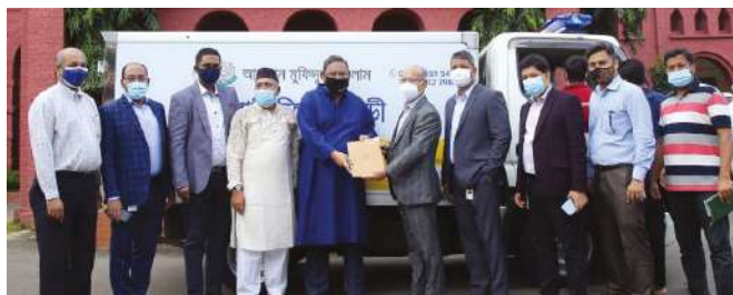
Freezer van handover to Anjuman Mufidul Islam