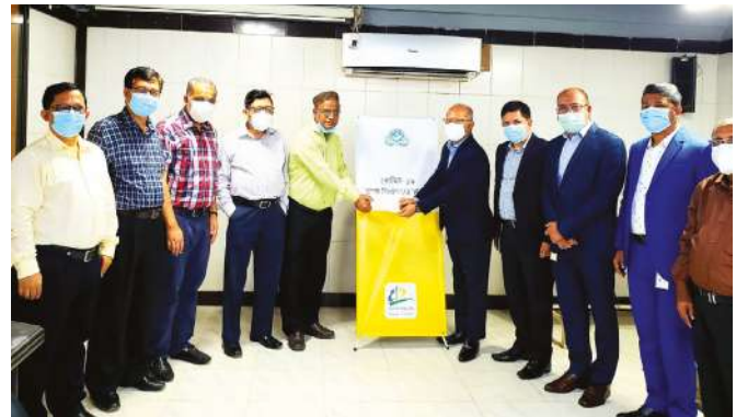
EBL provides financial assistance to Chattogram Maa O Shishu Hospital