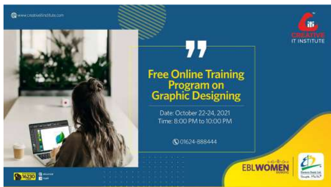
EBL arranges 3-day online training program on Graphic Design by Creative IT Institute

EBL and Creative IT Institute have signed an agreement under which EBL customers will enjoy special discount and privileges in IT skill development training programs offered by Creative IT Institute. In addition, EBL Women Banking in association with Creative IT Institute arranged a 3-day online training program on graphic design.