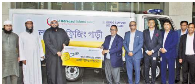
Freezer van handover to Al-Markazul Islami