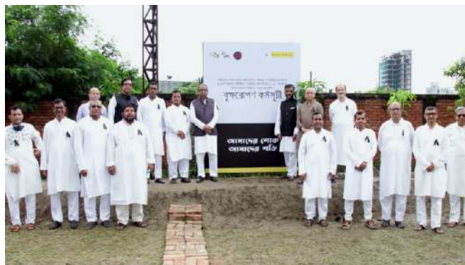
EBL organizes tree plantation program

EBL organized a tree plantation program in Dhaka to observe the National Mourning Day and to pay tribute to the Father of the Nation Bangabandhu Sheikh Mujibur Rahman and to those who were martyred on 15 August 1975. Planting trees was a better way of paying homage to the memory of Bangabandhu, who dreamt of a green Bangladesh and initiated tree plantation campaigns in the country soon after the Independence. Saplings of different varieties of mango were planted to mark the day.