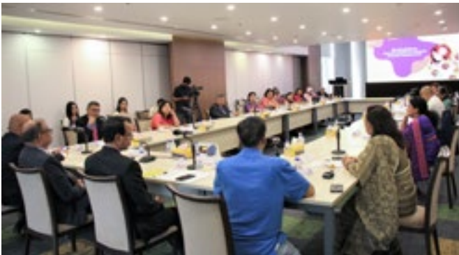
Roundtable discussion on 'Financial Inclusion for Women's Economic Empowerment'

Additionally, EBL launched the country's first women-centric prepaid card, EBL Mastercard Aqua Women Prepaid Card, offering exclusive offers for women.