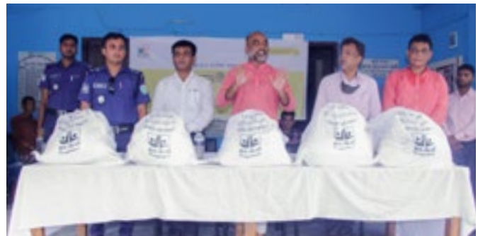
To observe the National Mourning Day, 2022 EBL distributed food packages to the flood-affected people in the Sylhet and Sunamganj area through ActionAid Bangladesh and BURO Bangladesh.

To observe the National Mourning Day and in memory of the "Father of the Nation", Bangabandhu Sheikh Mujibur Rahman and his martyred family members, EBL organized the distribution of food items to flood-affected people in the Sylhet and Sunamganj area. In collaboration with well-known NGOs, EBL donated BDT 5 million towards distributing food packages to 4,850 families in those areas.