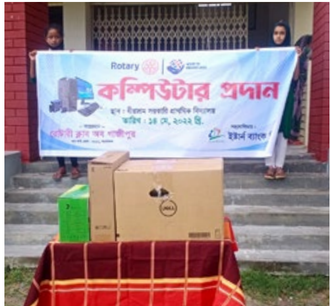
EBL donates computer and equipment to Dhirasrom Govt. Primary School