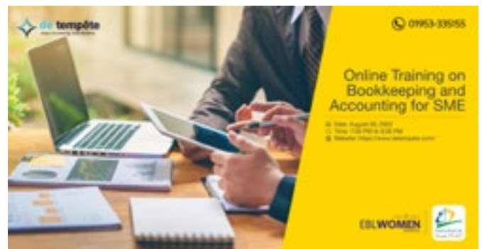
EBL organizes different training programs for women entrepreneurs.