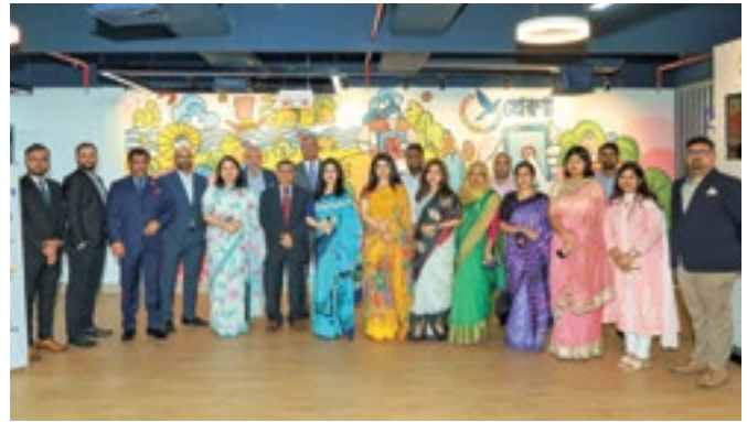
MoU signing Ceremony with Prerona Foundation.

EBL and Prerona Foundation launched Joyee, a co-branded program to develop women entrepreneur's skills and support their business growth. It offers a structured approach and assistance in transforming their ventures into successful, scalable and sustainable ones.