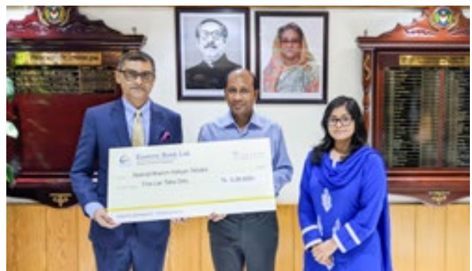
EBL donates to Special Branch Kallyan Tohobil, Bangladesh Police for scholarships to their meritorious children.

As a responsive corporate citizen, the Bank demonstrates its commitment to promoting education and supporting the development of the country's youth through its initiatives. EBL has provided BDT 0.50 million to the Special Branch Kallyan Tohobil, Bangladesh Police to provide scholarships to the meritorious children of their employees. The initiative aims to inspire them to reach higher goals and elevate societal aspirations.