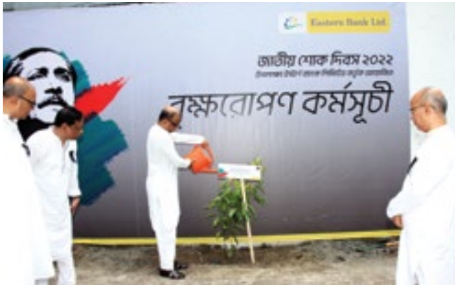
EBL organizes tree plantation program to observe the National Mourning Day.