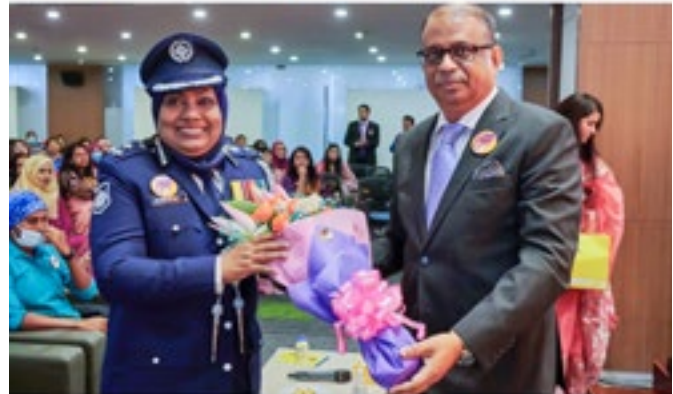
EBL celebrates Womanhood at Head Office