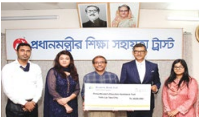
EBL donates to Prime Minister's Education Assistance Trust

Eastern Bank Limited contributed BDT 3.00 million in 2022 to the Prime Minister's Education Assistance Trust to support the government's efforts to provide financial assistance to underprivileged students in the country. The fund provides financial assistance through stipends, tuition fees, admission fees and other educational support to underprivileged students who cannot afford the cost of education. Such initiatives demonstrate our commitment to promoting education and supporting the development of the country's youth.